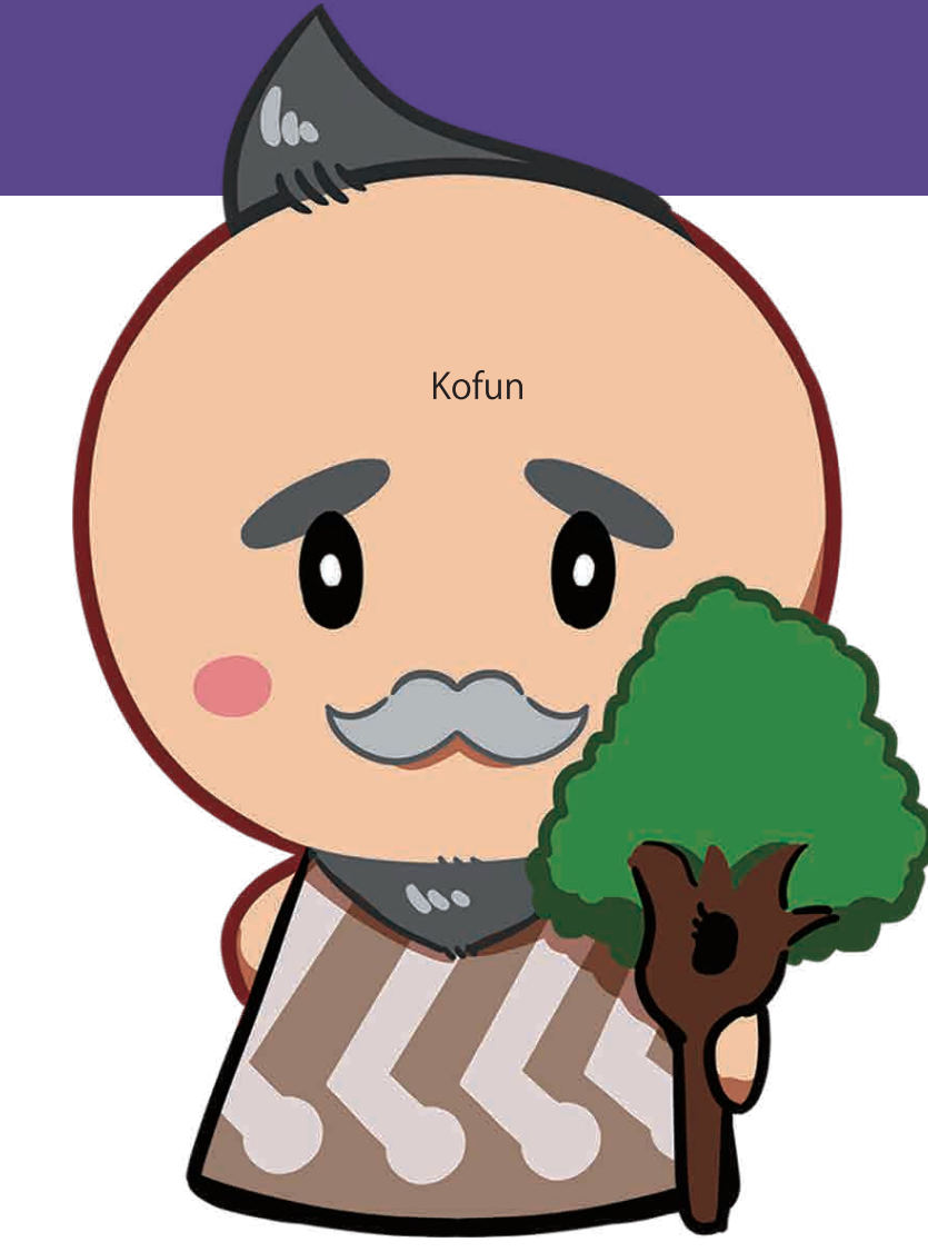
Tsukazaki Kofungun Tsuka-ji