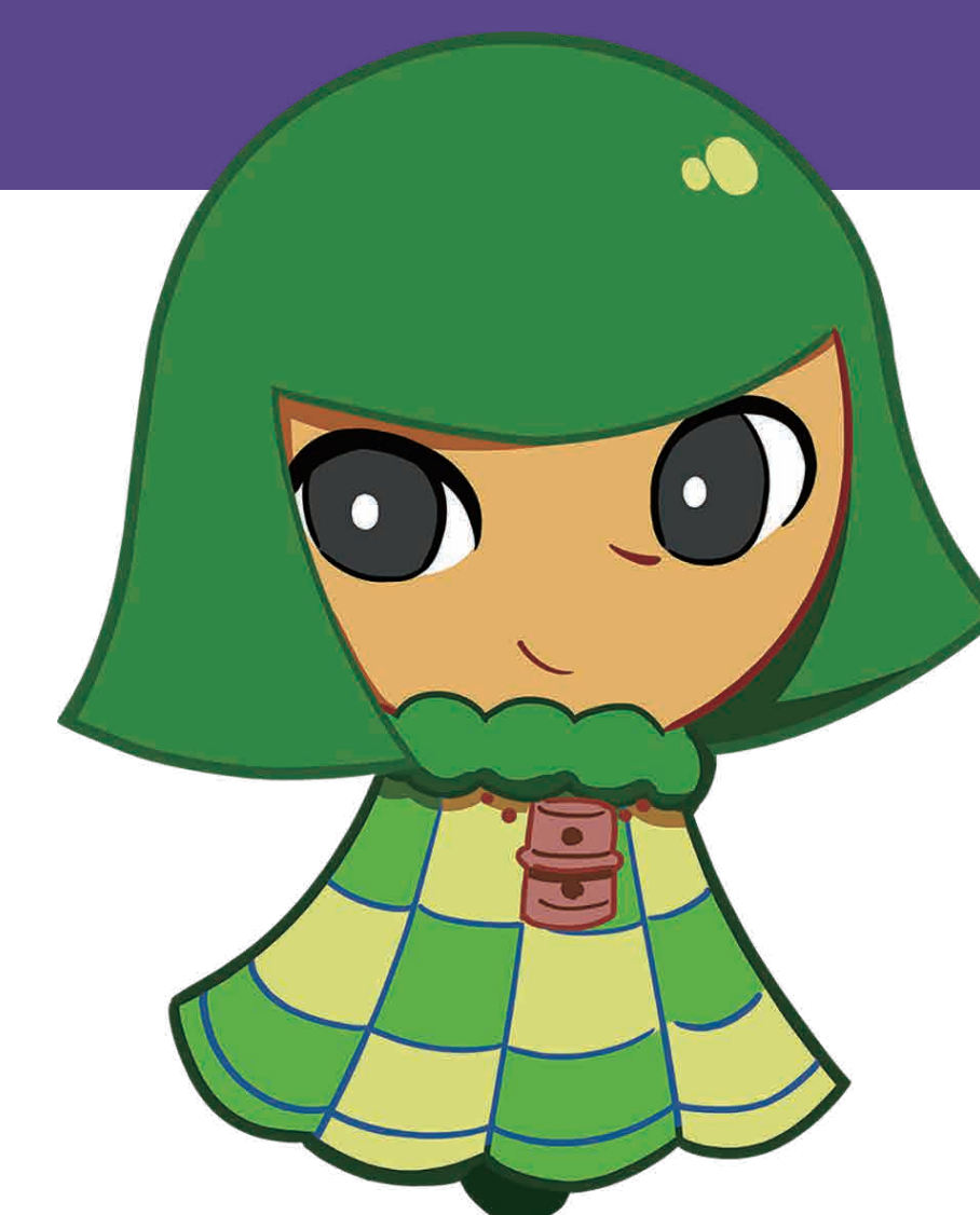
Yokose Kofun Romanto-kun