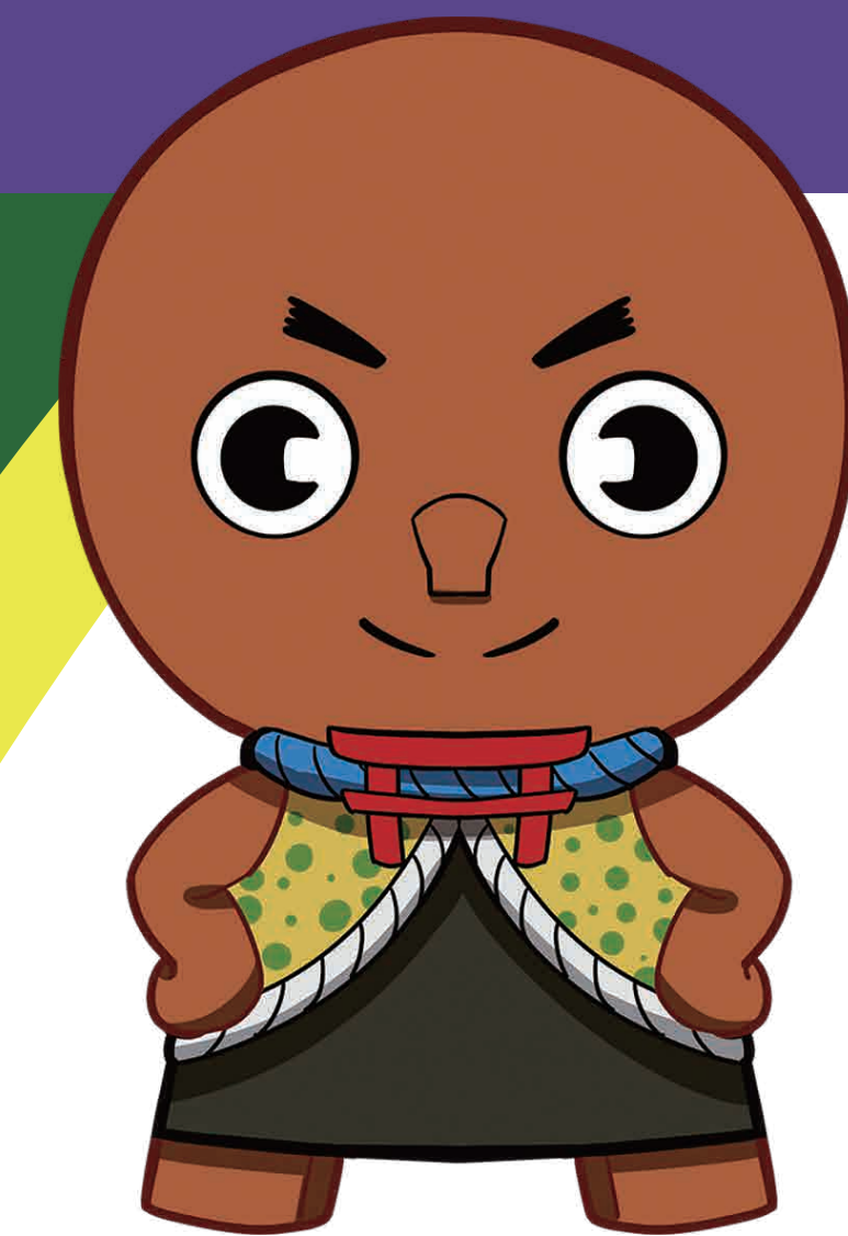
Tojin Kofungun Tojin-maru